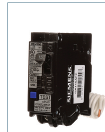
1-Pole Combination Type AFCI