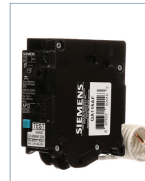
1-Pole Branch Feeder AFCI