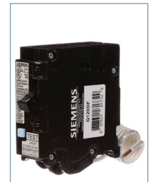
1-Pole Dual Function AFCI/GFCI