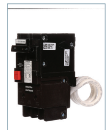
2-Pole Equipment Protection